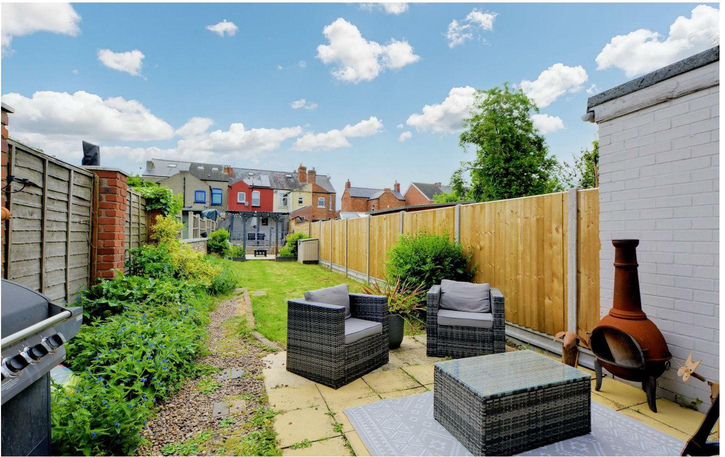
A TWO BEDROOM SEMI DETACHED HOUSE WITH A LARGE ENCLOSED GARDEN.

Robert Ellis are pleased to be instructed to market this well presented two bedroom semi detached home. The property would be suitable to first time buyers, investors, families and people looking to downsize.